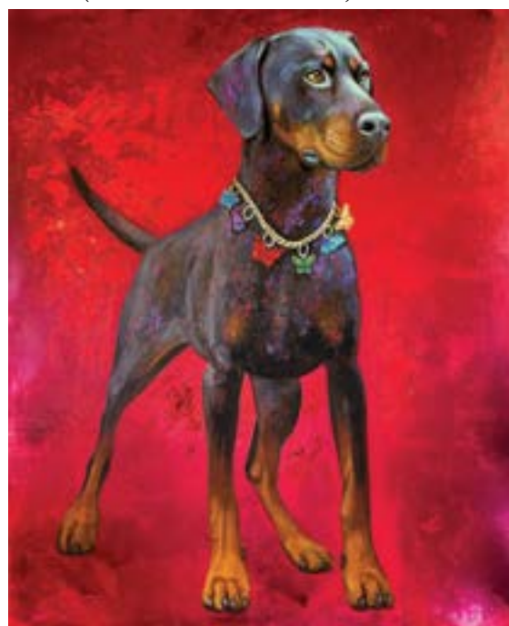
Trezher (Animals of the Chinese Zodiac)