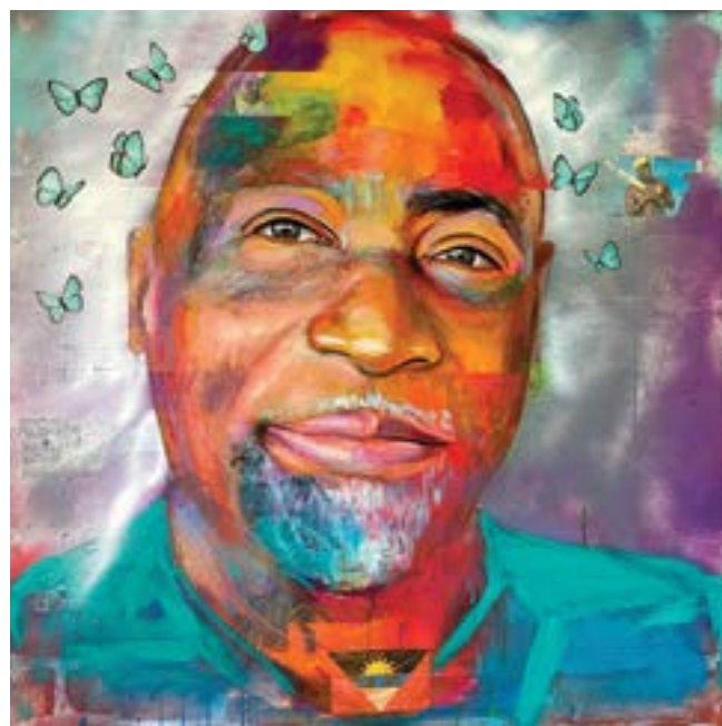
Sir Viv Richards (Pop Icons)