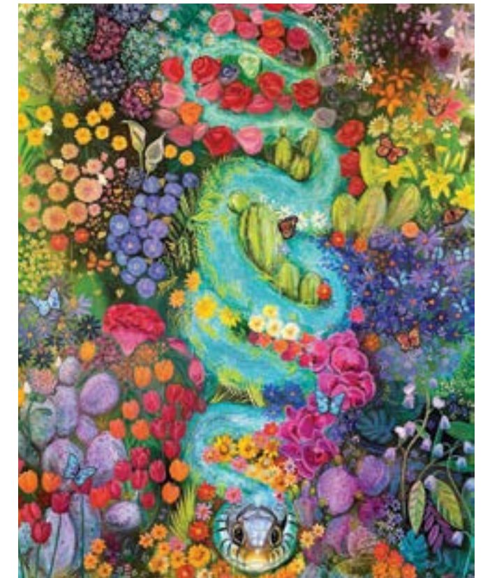
Shé (Animals of the Chinese Zodiac)

The third collection, in which the influence of pop icons takes centre stage, is an ongoing journey of Naydene's in the study of portraiture. Butterflies represent fleeting beauty and change. ●