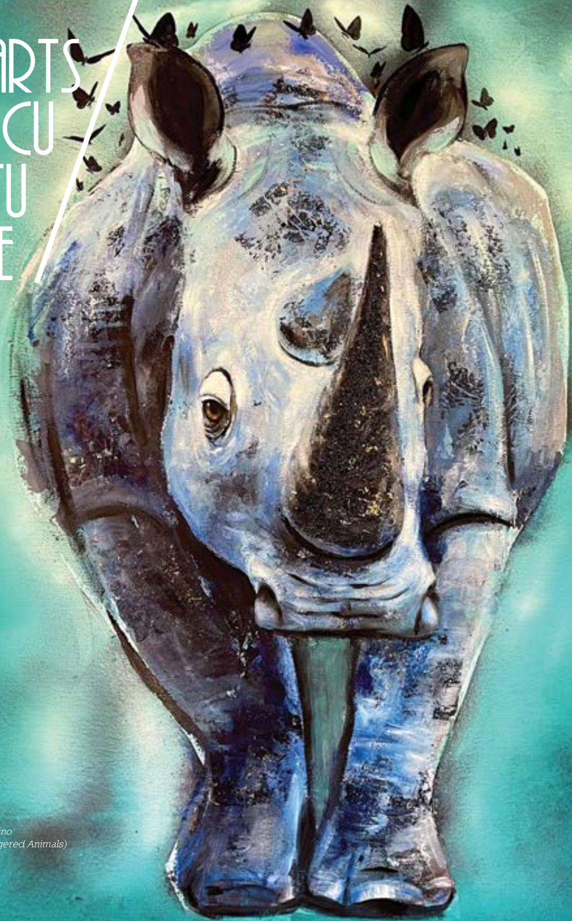
Blue Rhino (Endangered Animals)